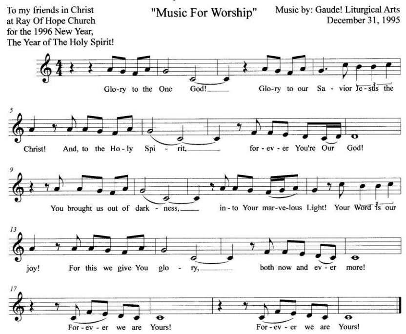
©1993 by Gaude! Liturgical Arts. All Rights Reserved. International Copyright Secured. Reprinted here under CCLI#706121